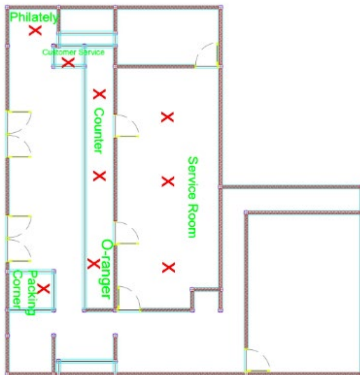
Figure 2. Layout of the 1st floor