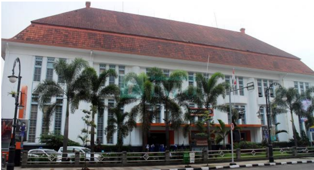
Figure 1. Front view of the post office